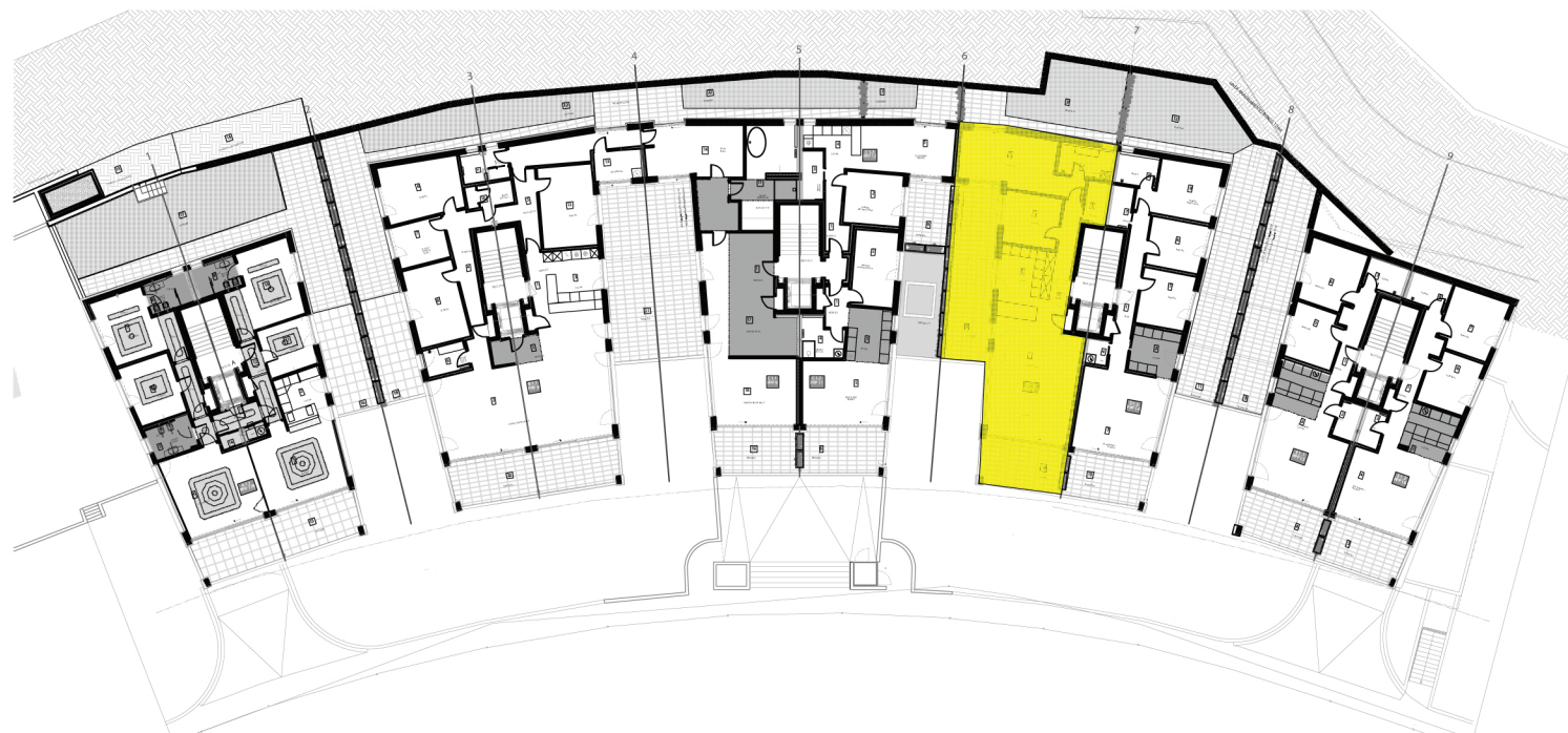
Piano Primo scala 1:500