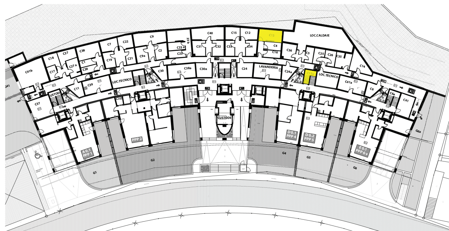
Piano Terra scala 1:500